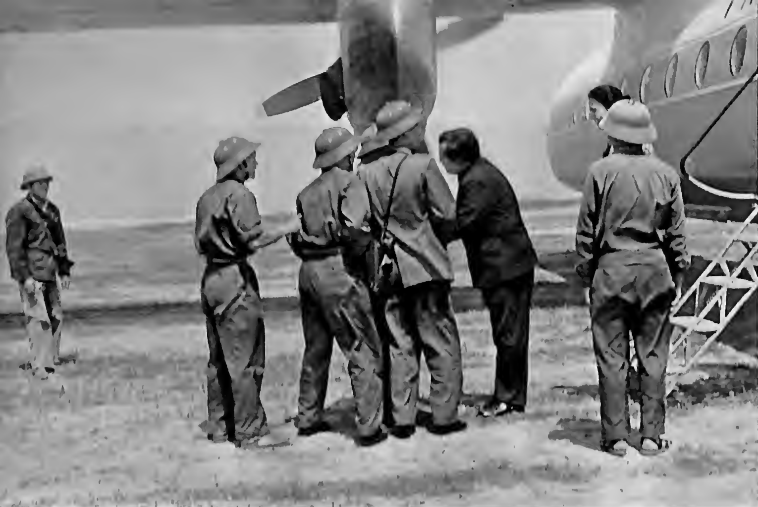
Arriving at Dong Hoi from Hanoi, Cambodian Head of State Samdech Norodom Sihanouk and Madame Sihanouk are warmly welcomed by military leaders of the Democratic Republic of Viet Nam, who escort them to the border.